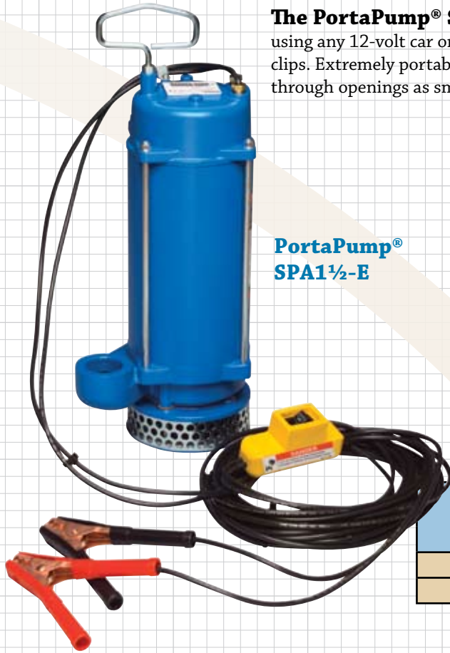
PortaPump® SPA1 1/2-E

The PortaPump® Submersible, Battery-Powered Pump operates using any 12-volt car or truck battery. It comes equipped with cables and battery clips. Extremely portable, the pump weighs only 33 pounds (15kg) and can fit through openings as small as 10" (25cm). Electrically safe and whisper quiet.